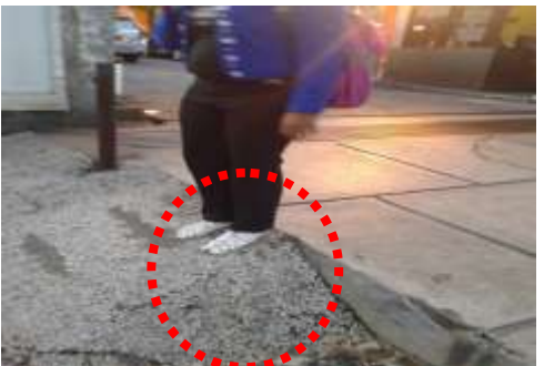
Figure 2. The difference of trotoar height with no color difference or material

According to their experience, they generally assume that broken pavement could be the significance physical barrier for their movement. Unsafe sidewalks of Dago are also caused by discontinuities and a hole in the pavement. The other physical barriers for low vision based on in-depth interviewed and in addition that presented by Golledge (1997) and Jacobson (1998) is height differences with no differences of color/material meanwhile the street vendor was including in discontinuity of movement. The near-sight low vision (1-2 m) have less spatial ability than far low vision (more than 3 m) though the near-sight still can see shadow of the object. Some participants of near-sight low vision in direct observation got accident in front of Kartika Sari sidewalk, from Simpang Dago direction to Cikapayang. This height differences that harm low vision is described in picture 2 below.