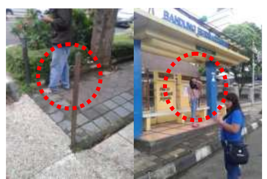
Figure 3. Street furniture as obstacles in the center on Dago sidewalk

Darkness/shadow: the difference of dark and light makes low vision takes more attention against surrounding area. Shadow of the trees could seem as a hole on the sidewalk so they have to be wary and take more attention and focus when they are passing through. As Proulx stated that neural basis attention was analogous to the changing of luminance level or contrast with fixation of the eye (Proulx, 2007) (see figure 4)