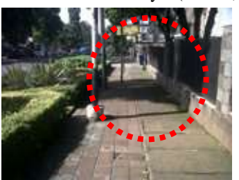
Figure 4. Shadow as confused space for low vision

Darkness/shadow: the difference of dark and light makes low vision takes more attention against surrounding area. Shadow of the trees could seem as a hole on the sidewalk so they have to be wary and take more attention and focus when they are passing through. As Proulx stated that neural basis attention was analogous to the changing of luminance level or contrast with fixation of the eye (Proulx, 2007) (see figure 4)